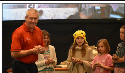
July 2018 Experience Israel Now Newsletter