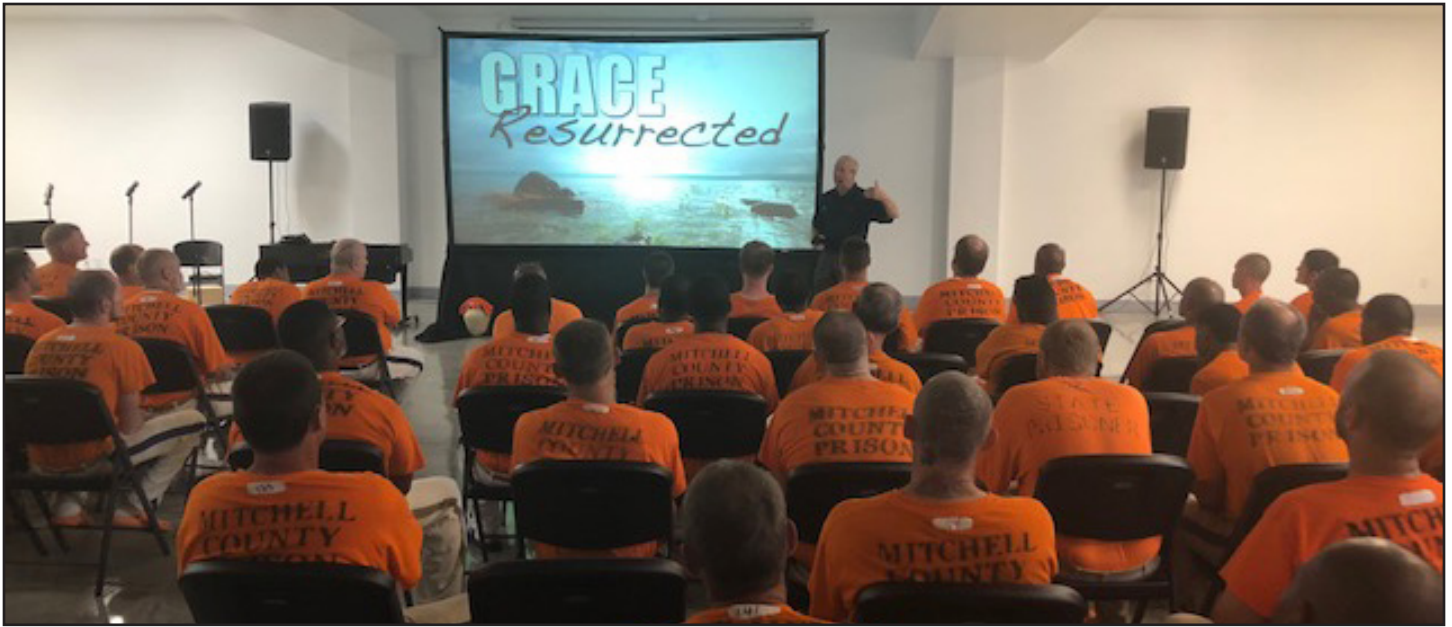
A four-day prison revival in Mitchell County, Georgia took us back to our roots in June. EIN was birthed at Central State Prison in Macon. Attendance at this event averaged 53 per night. A video of the prison choir singing garnered 7,500 views on Facebook!